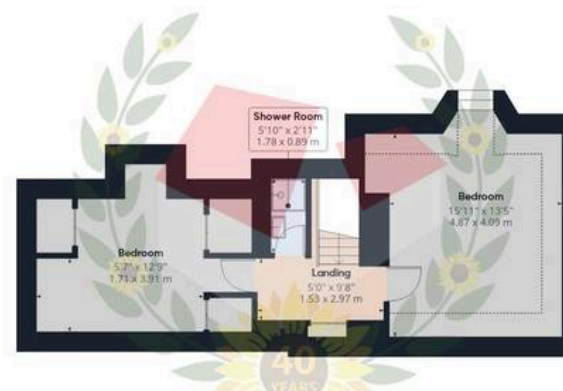
Floor 3 Building 1